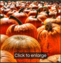
Pumpkins by Linnaea Mallette